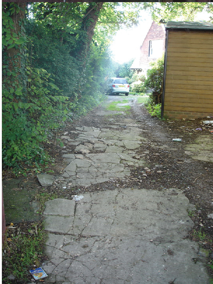
Restricted access for emergency vehicles created by Elm with swept stem and garden building.